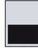
1/2 Page Horizontal 7 by 4 5/8