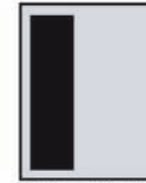
1/3 Page Vertical 2 1/8 by 9 1/2