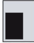
1/2 Page Vertical 4 5/8 by 7