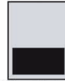
1/3 Page Horizontal 7 by 3