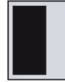
2/3 Page Vertical 4 5/8 by 9 1/2