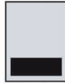
1/4 Page Banner 7 by 2 1/8