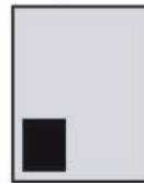
1/8 Page Vertical 2 1/8 by 3 3/8