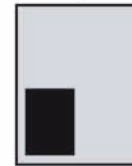
1/4 Page Vertical 3 3/8 by 4 5/8