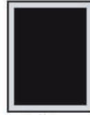
Full Page 7 by 9 1/2

Complete Poly-Bagging and Insert Services Are Available Upon Request.