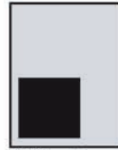
1/3 Page Square 4 5/8 by 4 5/8