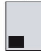
1/8 Page Horizontal 3 3/8 by 2 1/8